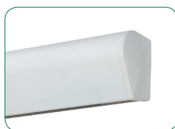
... the stylish standard Linea ....