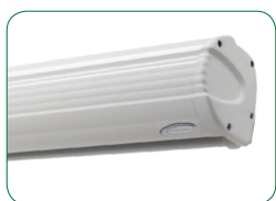
Available in the Diplomat Electric....