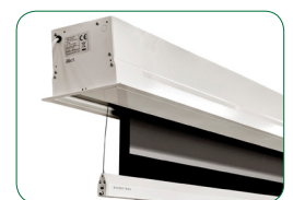
... and the Freya