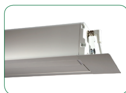
... and the Sesame 2.1.